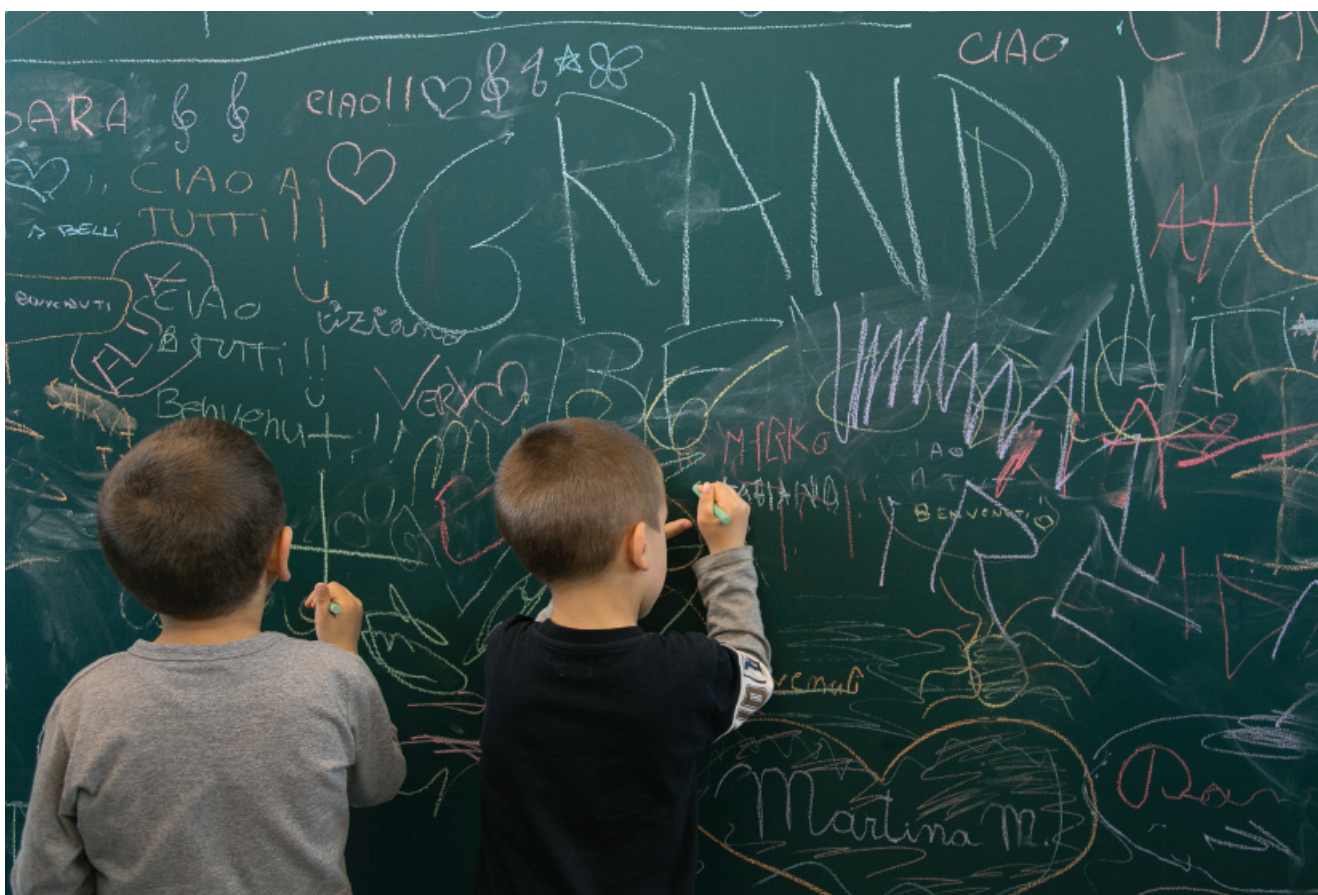
Children write on their blackboard in Italy where around 1 million children live in poverty.

In other cases, recent transitions have been founded on a longer period of more inclusive growth. In India and Bangladesh, for example, poverty rates and childhood deprivations have fallen as the livelihoods of a significant proportion of households have improved. 14 Where transitions have been achieved without oil and mineral development, economic inequality was often lower in comparison with other lower-income countries to start with, and has remained comparatively low. 15